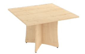
Square Roma Lorenzo