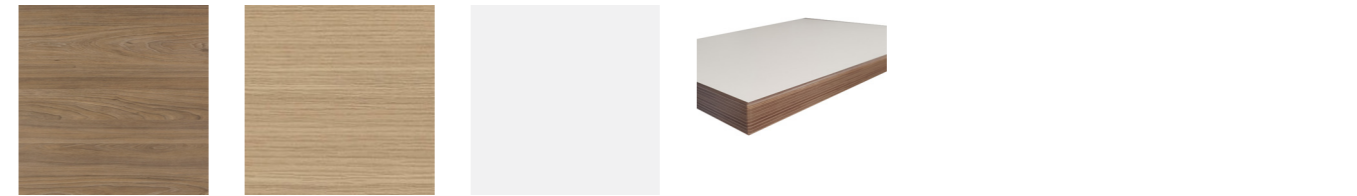
(SE) Swiss Elm