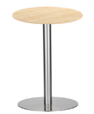
Poseur Height Bistro