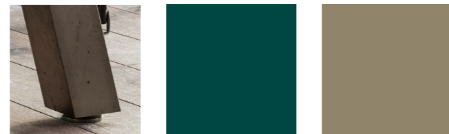
(LQ) Clear Lacquer (Matt)