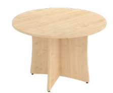
Circular Roma Lorenzo