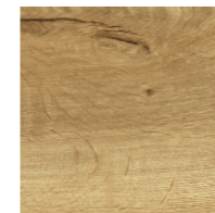
(HO) Halifax Oak

IMPORTANT: MFC and Metal Finishes shown here are for illustration purposes only.